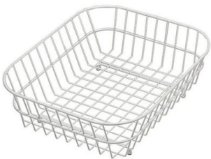
White basket 8612 100